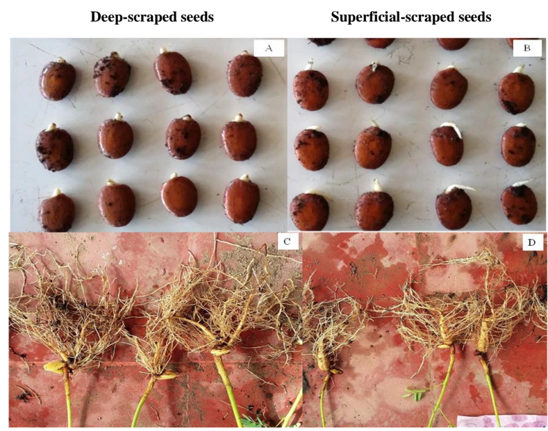
Figure 2. Effects of mechanical scarification on germinated seeds and seedling morphology. A: excised radicle of deep-scraped seeds, B: intact radicle of superficial-scraped seeds producing respectively C: seedlings with abundant and fasciculated root system and D: seedlings with tuber-like taproot

During the first two months of growth, decapitation of the embryonic radicle did not show any impact on growth parameters (height, leave number, stem diameter and biomass) (Table 2). At three months, except root biomass of seedlings from superficial-scraped seeds which was significantly important, all other growth parameters evaluated here remained comparable (Table 2). Whatever deep-scraping affects the root biomass, other parameters were not affected. This would suggest that deep-scraping has no impact on the general growth