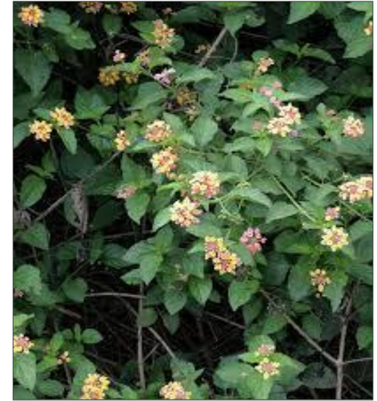
Umuhengerihengeri (Mavyi ya kuku)

Ibimera mvamahanga birahungabanya cane ibice bikikije amazi n'ibice vy'amazi vy'ikiyaga cohoha, bigateza ingorane ku bimera n'ibikoko bihasanzwe, bikagira n'ingaruka mbi ku buzima bw'abantu baba ku nkengera zaco.