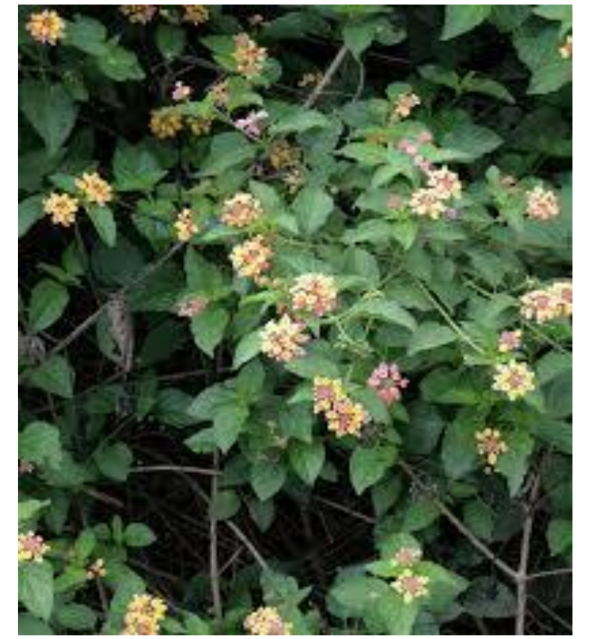
Umuhengerihengeri (Mavyi ya kuku)